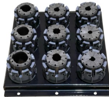
Quick change die system